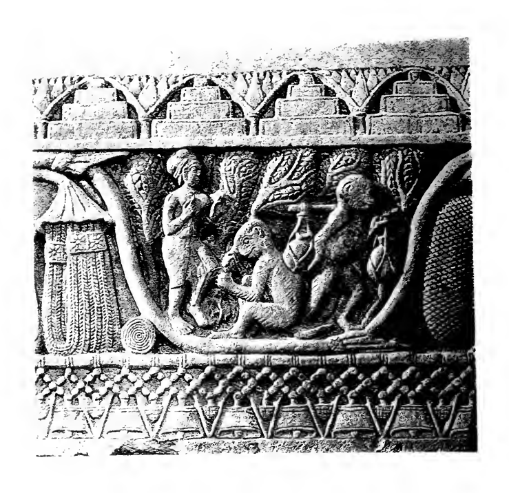
SCENE FROM THE STUPA OF BHARHUT BLUSTRATING JATAKA 46 (from Cunningham, Pl. XLV, 5.)