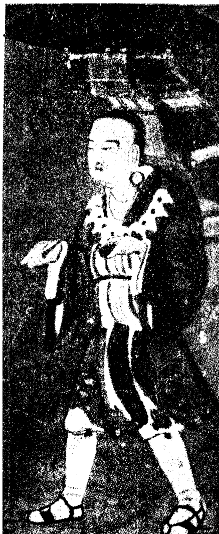
Hsuan-tsang (596-664 A. D.) The Tripitaka Teacher of Dharma of the Great Tang Dynasty.